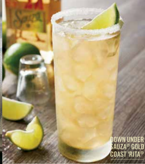
DOWN UNDER SAUZA ® GOLD COAST 'RITA ®

DOUBLE CHOCOLATE (590 calories) or SEASONAL FLAVOR o (430-570 calories)