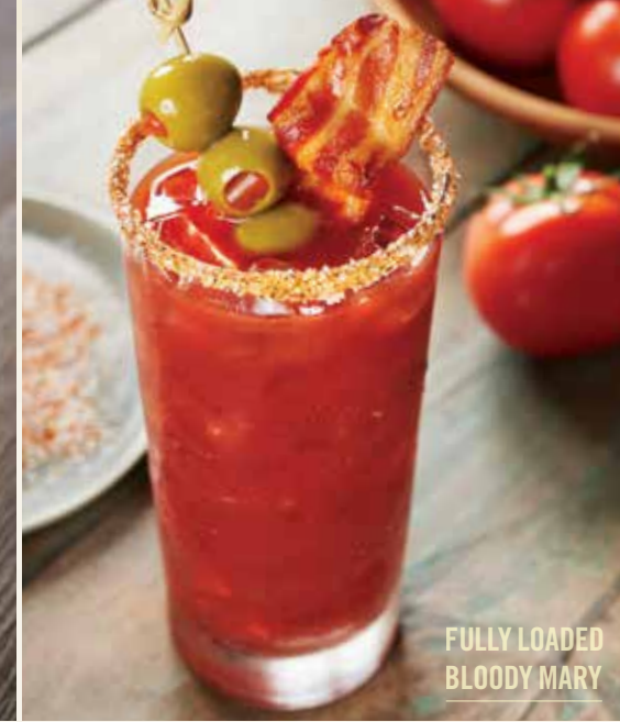
FULLY LOADED BLOODY MARY