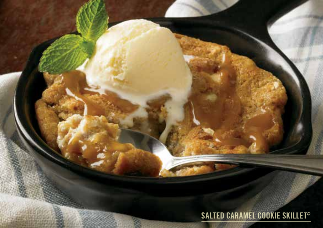
SALTED CARAMEL COOKIE SKILLET o